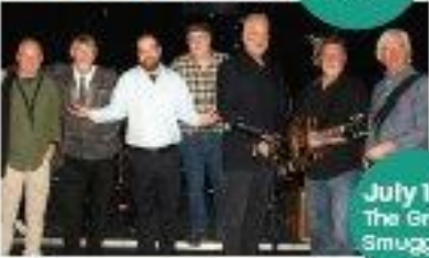
July 10 The Grape Smugglers