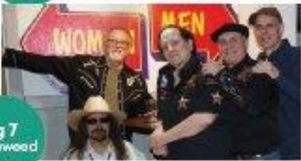
Aug 7 Loco weed