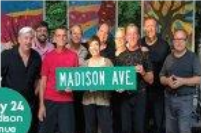
July 24 Madison Avenue