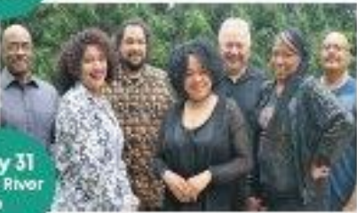
July 31 East River Drive