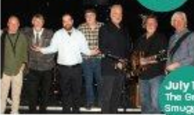
July 10 The Grape Smugglers