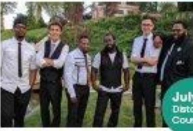
July 17 Distant Cousins