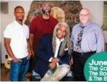
June 19 The Good, The Bad & The Blues

Ottawa Park Amphitheater 6 p.m. – 8 p.m. 2205 Kenwood Blvd. (Behind the Toledo Police Department Sub-Station.)