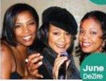
June 26 DeZire