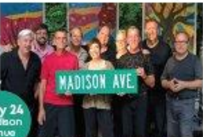
July 24 Madison Avenue