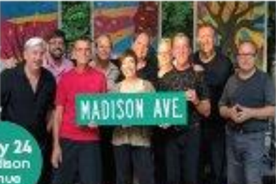
July 24 Madison Avenue