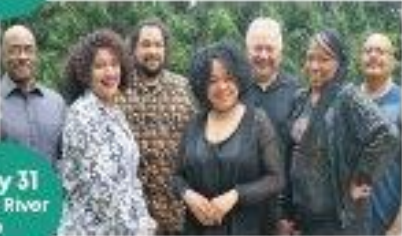
July 31 East River Drive