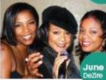
June 26 DeZire