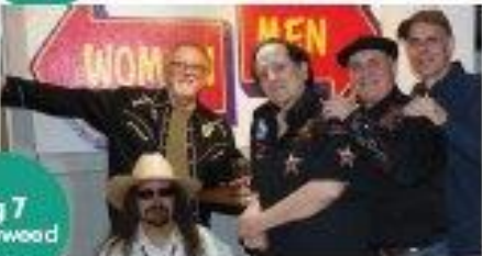
Aug 7 Locoweed