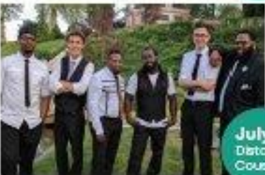
July 17 Distant Cousins